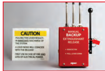
Manual Backup Shown with 3 Cables and Signage