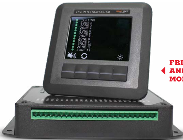
FBD-MZ DISPLAY AND CONTROL MODULE